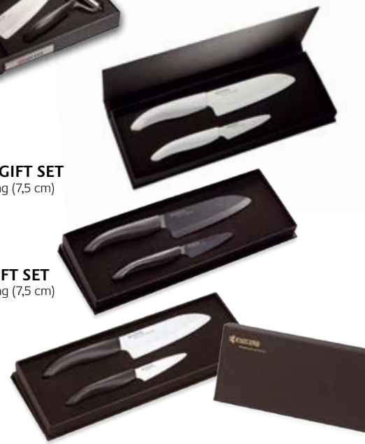
BLACK BLADE GIFT SET Santoku (14 cm) & Paring (7,5 cm) Knife Set, black