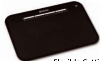
Flexible Cutting Board Elastomer BB-99 : 300 x 210 x 2 mm BB-100 : 370 x 250 x 2 mm