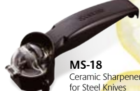
MS-18 Ceramic Sharpener for Steel Knives ● ●