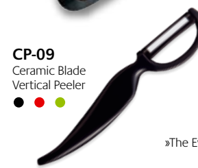
CP-09 Ceramic Blade Vertical Peeler ● ● ●