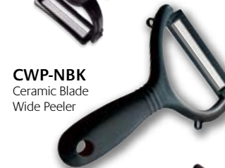
CWP-NBK Ceramic Blade Wide Peeler