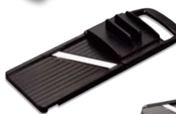
CSN-402 BK Adj. Wide Slicer with Hand Guard size : 358 x 128 x 15 mm