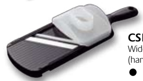
CSN-182S Wide Julienne Slicer (handguard included) ● ● ● ●