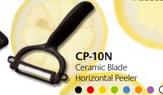
CP-10N Ceramic Blade Horizontal Peeler ● ● ● ● ● ● ● ● ● ○